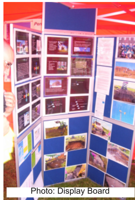
Photo: Display Board