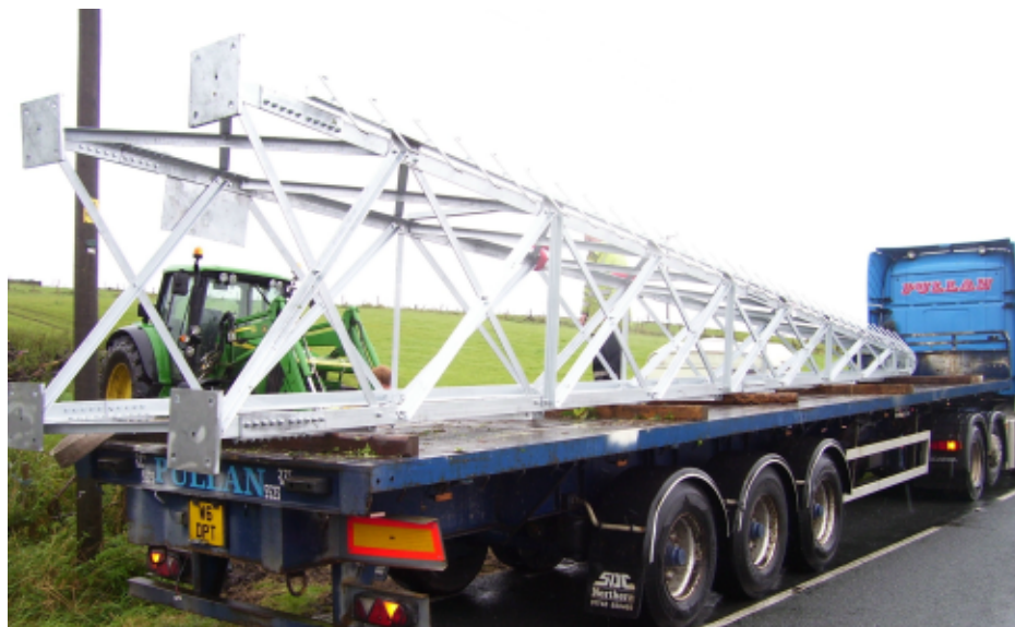
Photos: Installation of Community Wind Turbine

PCP has 65 shareholders from the areas shown in the chart below.