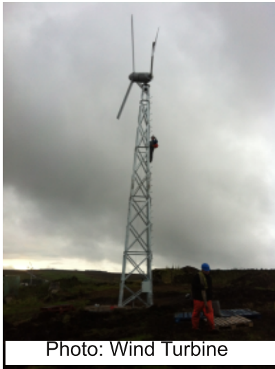
Photo: Wind Turbine

The community wind turbine is now up and running. To see how much electricity it has produced so far, and to get live readings of its output, go to www.powerinthecommunity.org .