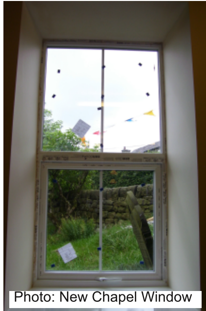
Photo: New Chapel Window

The insulation work at the Chapel has been completed. The work