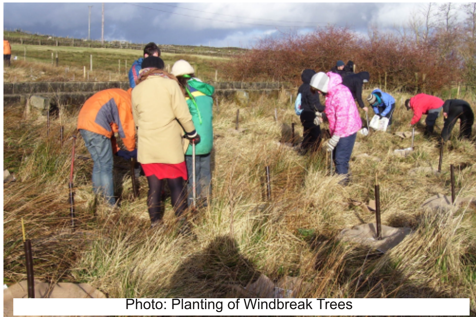
Photo: Planting of Windbreak Trees